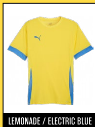
LEMONADE / ELECTRIC BLUE