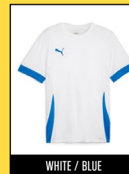
WHITE / BLUE

PLEASE FILL IN THE KIT ORDER FORM AND RETURN TO info@victoriapark.gg