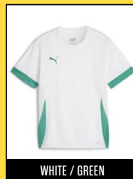
WHITE / GREEN