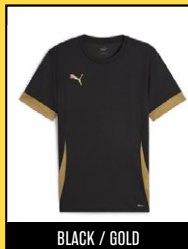
BLACK / GOLD