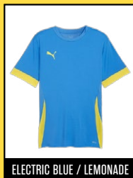
ELECTRIC BLUE / LEMONADE