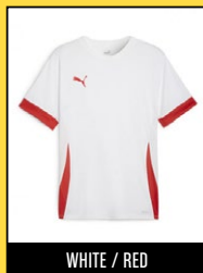
WHITE / RED